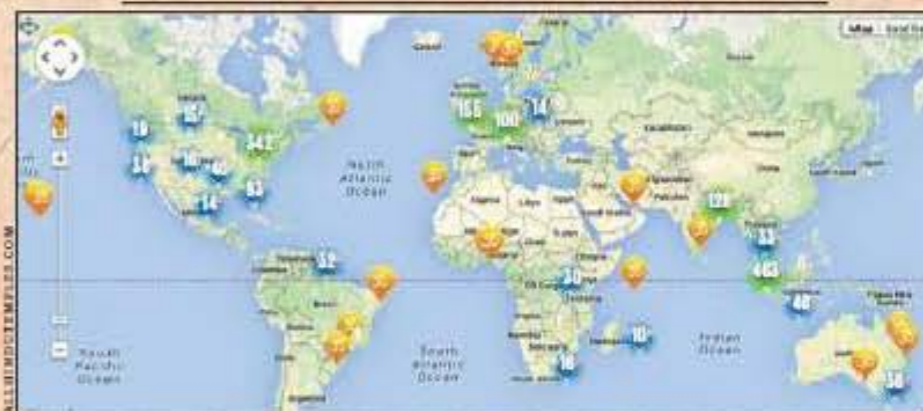
A world of temples: This map shows the many temples in the application's database

The application's creator, Hari Iyer, told