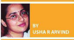
BY USHA R ARVIND

A Melbourne-based engineer develops an app that lists Hindu temples in 50 different countries